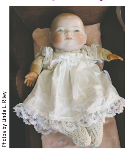
Bye-Lo Baby dolls like this one were first created in 1922