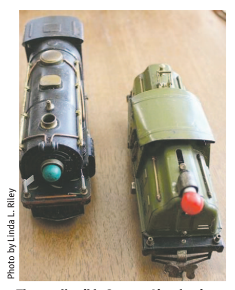
These collectible O-gauge Lionel trains were made before World War II

TimeWarp Toys is an online store owned and operated by a couple who live in the Catskill Mountains. They buy and sell toys and collectibles from the 1950s through the 1970s, and will travel for toy collections, or buy through the mail. Currently, "The Fugitive' is one of their highest-priced board games, at $175. A 1960s Viewmaster in mint condition is selling for $24; a 1950s tin hutch painted with a Pennsylvania Dutch motif is $30. For information, e-mail TimeWarpToys@aol.com, call 845-688-2221 from 9 a.m. to 9 p.m.or go to www.TimeWarpToys.com.