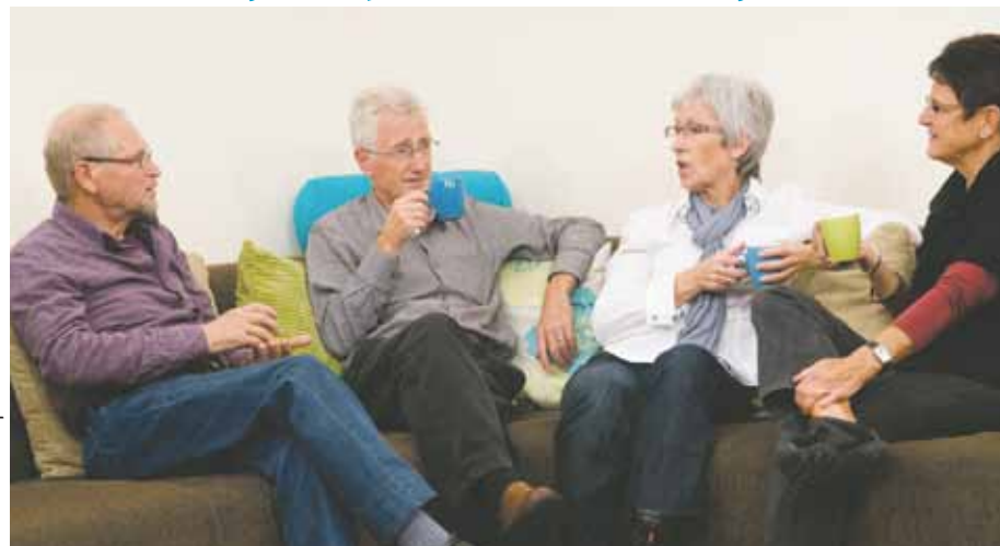
Milestones file photo

Gender-specific groups, including "Senior Gents" at the Older Adult Sunshine Center in West Philadelphia and "Phenomenal Women" at Philadelphia Senior Center – Allegheny Branch, are characterized by less structured discussions. There are also topic-related or goal-oriented