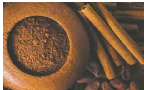
Cocoa powder and cinnamon are key ingredients in mole sauce.

One legend about its origins has it that 16th century nuns were inspired by an angel to concoct a new dish that mixed different chilies together with spices, day-old