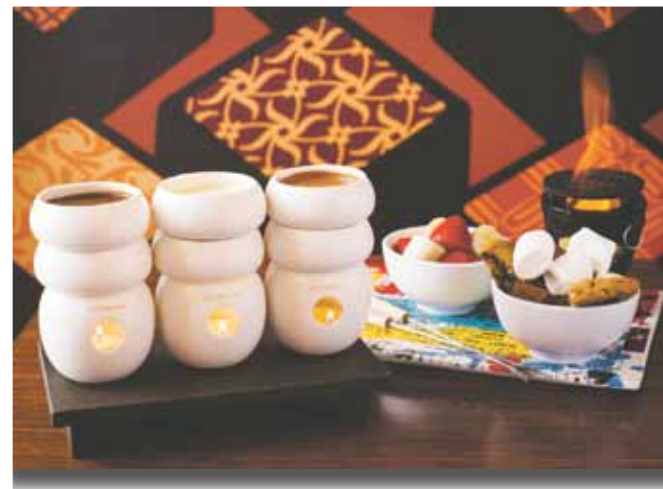
At Max Brenner: Chocolate by the Bald Man, customers enjoy a multi-sensory chocolate experience.

name. In 2001, he sold the chain to Strauss Elite, one of Israel's largest food conglomerates. The Philadelphia res-